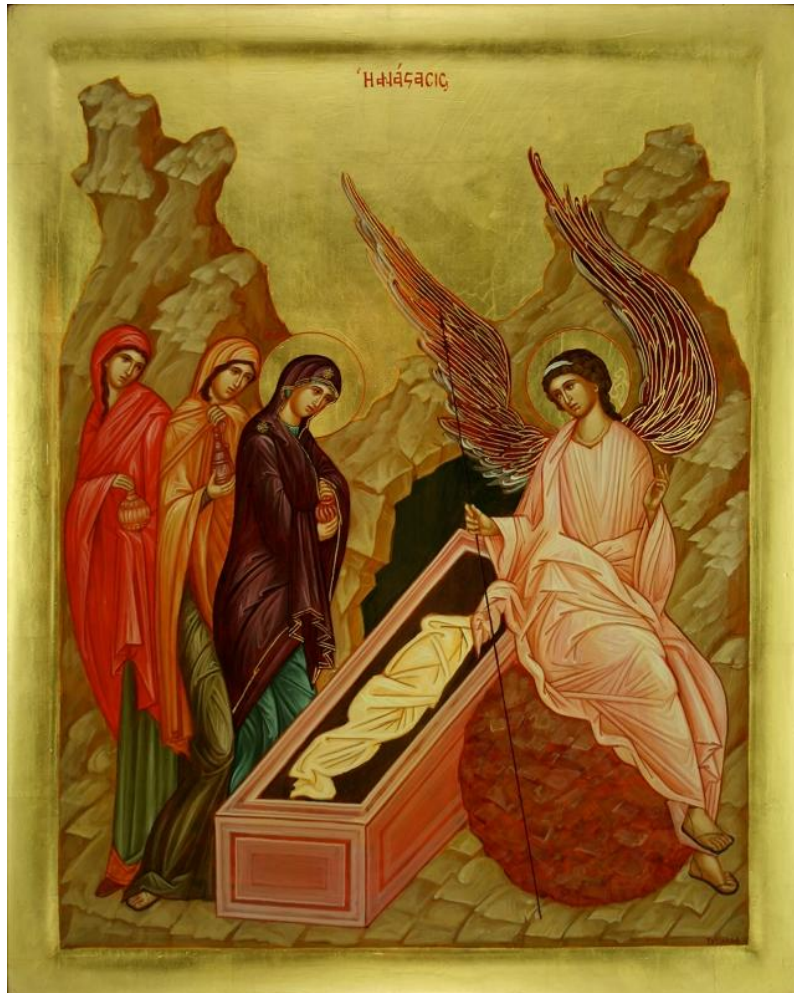
Holy Women at the Tomb Ss. Peter and Paul Orthodox Church Ben Lomond, California

For three days we have watched and waited. Tonight, we gather in the darkness of the grave seeking the light of the Paschal Mystery. Out of the darkness - fire - a burning bush in the desert, calls us to stop, to remember that we are on Holy Ground. Then we remember. It comes back to us piece by piece - the story of God's unfailing salvation for the whole world until the last piece falls into place and suddenly Jesus meets us - 'Greetings!' "The light has shined in the darkness and the darkness has not overcome it." This is Good News, indeed!